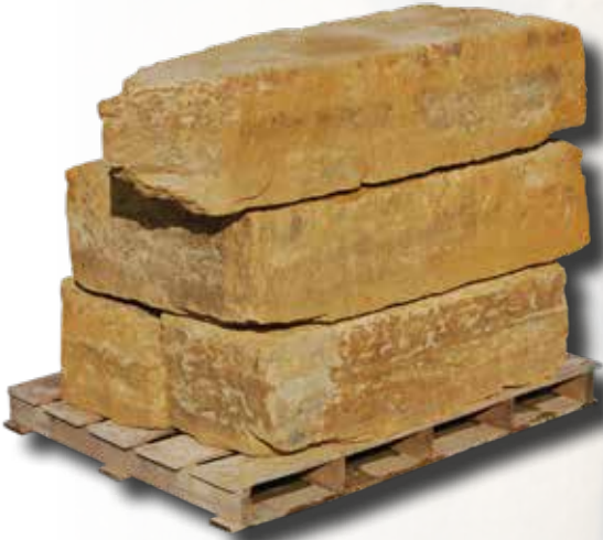
Rustic Buff 14"- 18" Benches # 33140