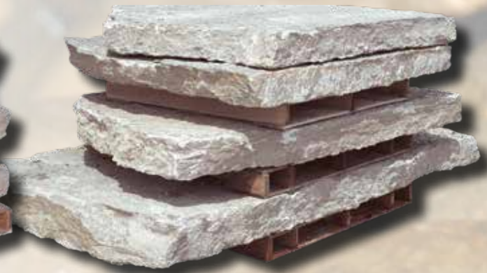
Canyon Gray Jumbo Steps 5' - 6' # 52104