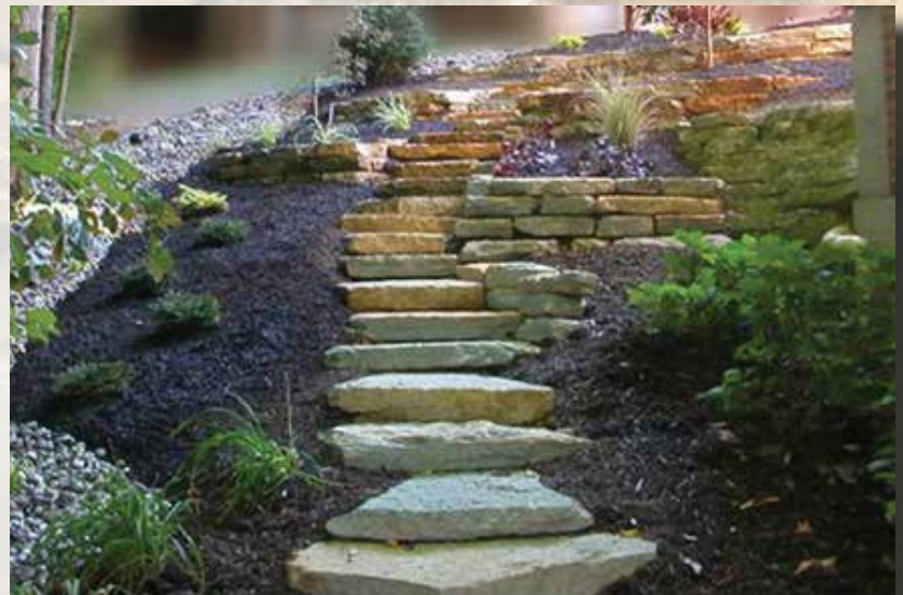
Southern Buff 6"- 8" Slabs