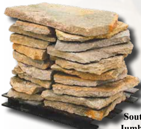
Southern Buff Jumbo Flagging Double Stack #42114