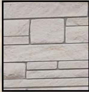
Indiana Limestone # 101221