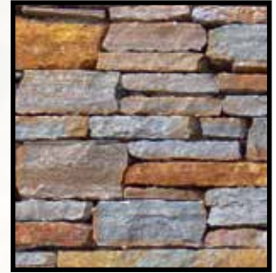
Southern Buff # 41240