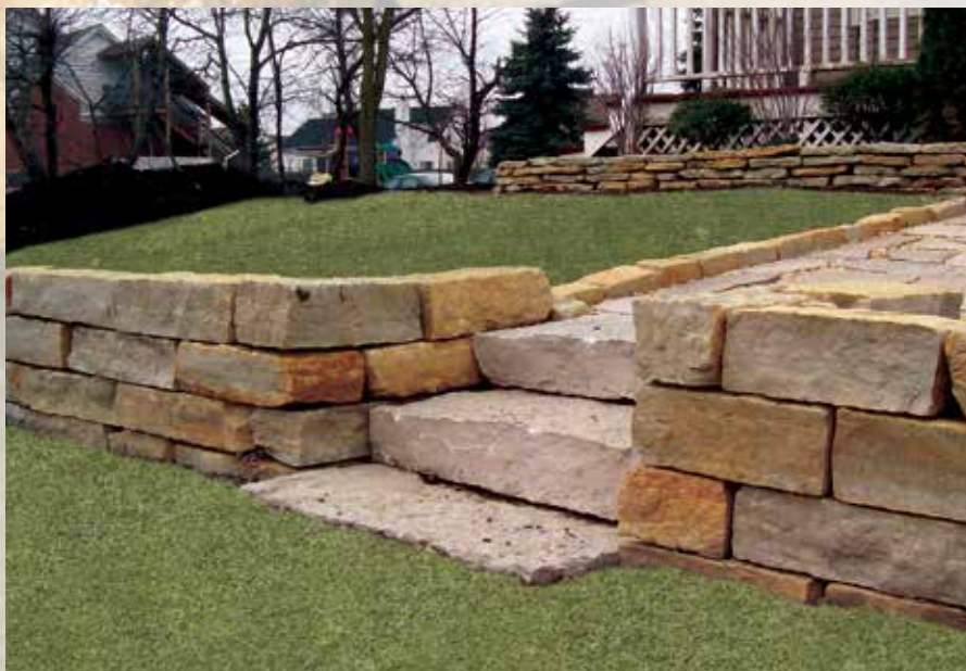
Rustic Buff 5\"/>