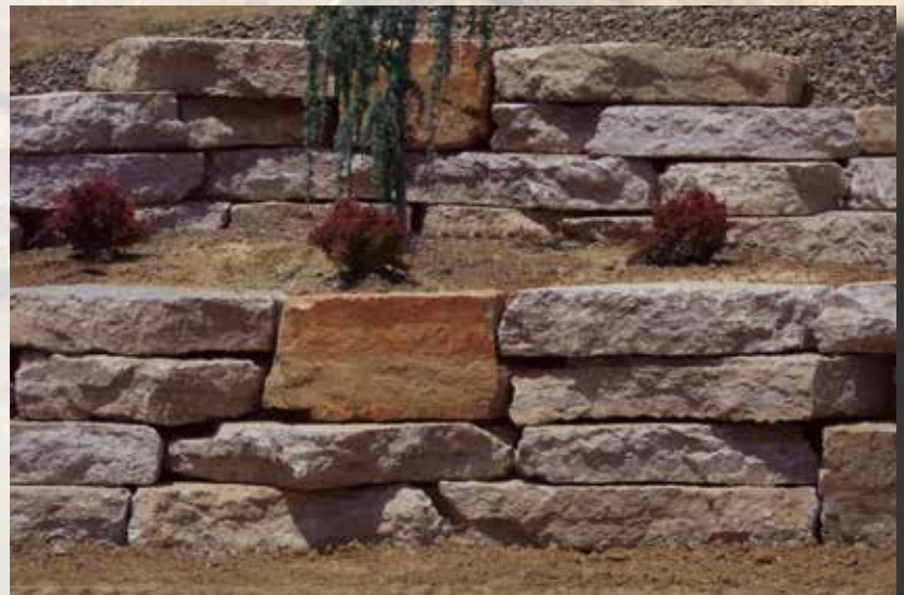
Rustic Buff Beige Outcroppings with Rustic Buff Chunks

Slabs are larger pieces of outcroppings typically used for Step/Treads or extremely high retaining walls face footage will be approximately 1/2 of above info