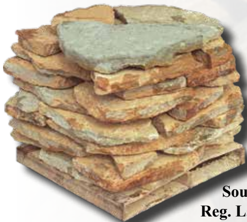
Southern Buff Reg. Large Flagging # 42113