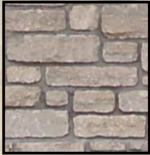
Canyon Gray # 51240