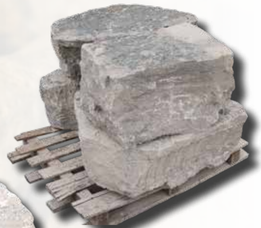
Canyon Gray 14" - 15" Chunks # 53131