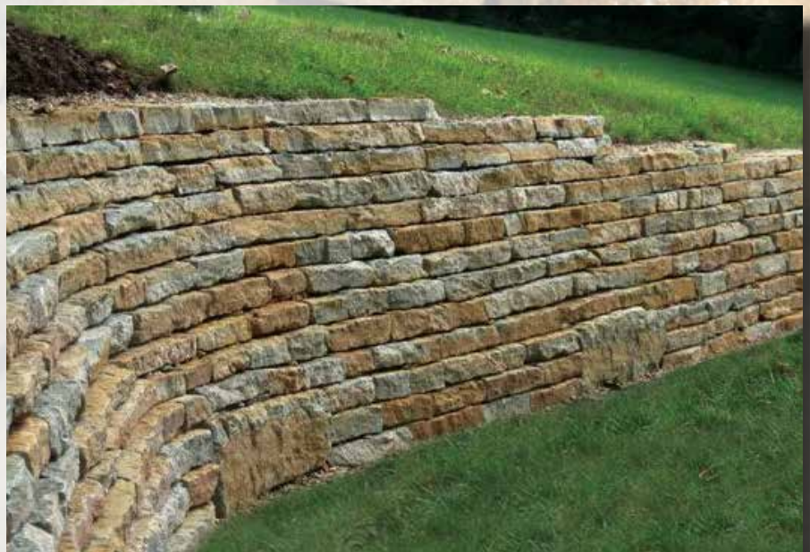
Southern Buff Wall Stone used in retaining wall