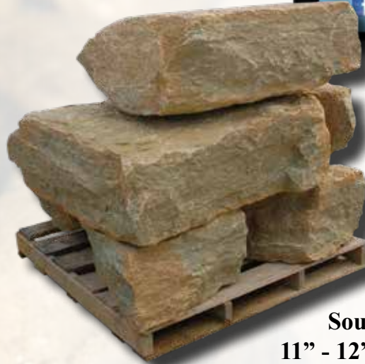
Southern Buff 11" - 12" Outcroppings # 43110