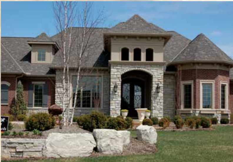
Canyon Gray Veneer