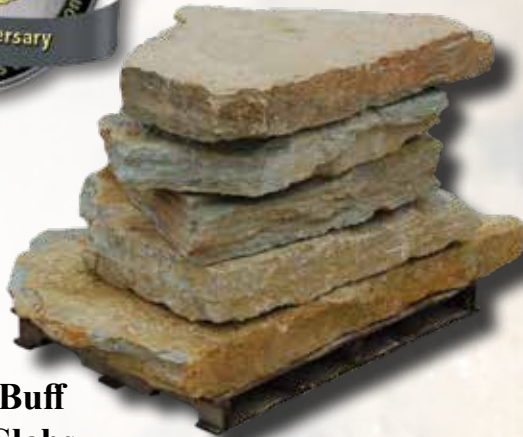
Rustic Buff 5" - 6" Slabs # 33106