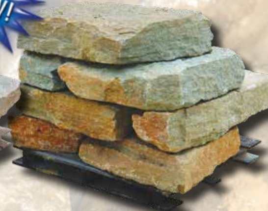
Southern Buff 8.5" -9.5" Outcroppings # 43108