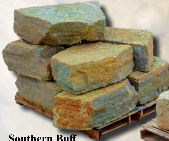
Southern Buff 12" Chunks # 43131