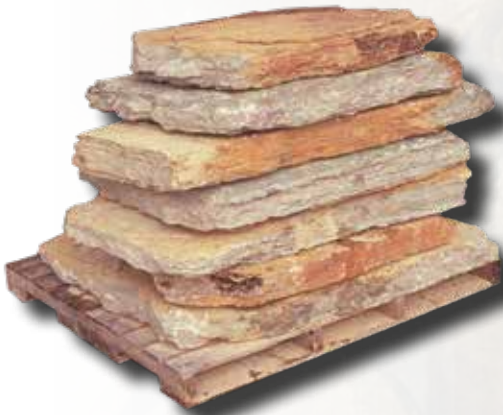
Southern Buff Natural Steps 3' -4' # 42102