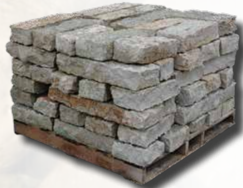
Rustic Buff Beige 5\"/>