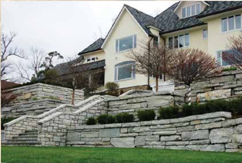
Canyon Gray 7" - 10" & 20" Outcroppings/Slabs