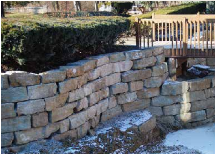
Southern Buff Chunks

Linear footage (LF) = Length @ 1 course high