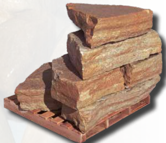
Rustic Buff # 33109 9"-10" Slabs/Outcroppings