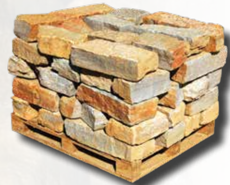
Rustic Buff 5\"/>