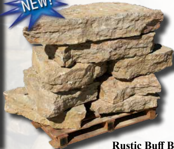
Rustic Buff Beige 8.5" - 9.5" Outcroppings # 33158