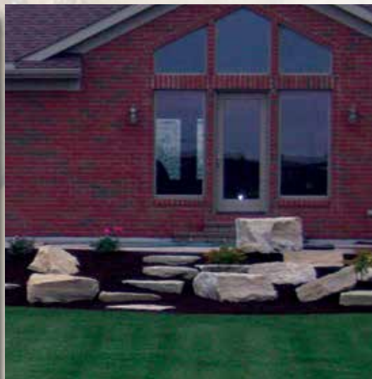
Canyon Tan Accent Boulders & Chunks