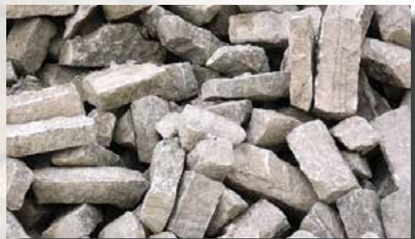
Canyon Gray "Bulk" Split Veneer-Rubble Building Stone # 51240