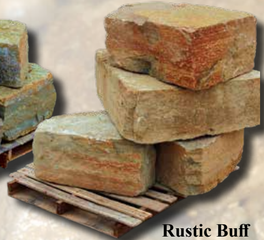
Rustic Buff 14" - 18" Chunks # 33131