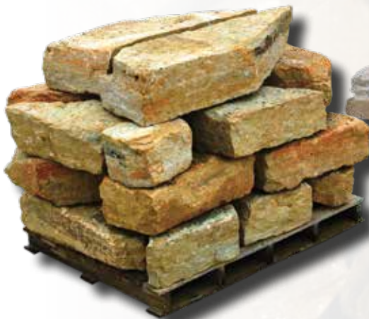
Rustic Buff 7"- 8" Lil' Chunkies # 33130