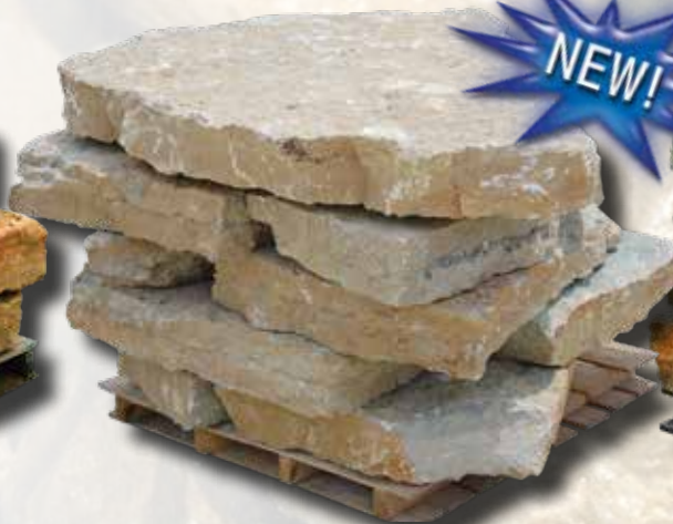
Rustic Buff Beige 6"- 8.5" Outcroppings # 33156