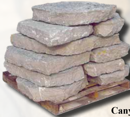
Canyon Gray Mini Steps 2' - 3' # 52101