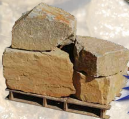
Rustic Buff 10" - 18" Accent Chunks # 33133