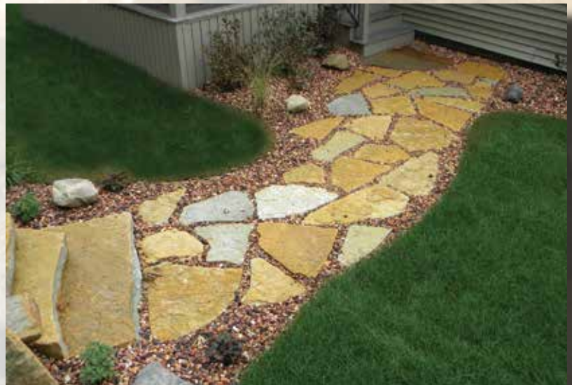
Southern & Rustic Buff Flagging