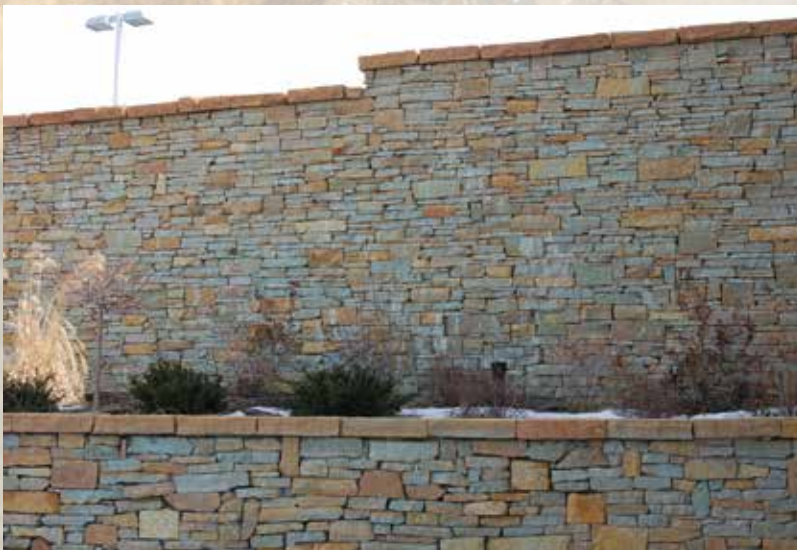
Southern Buff Veneer