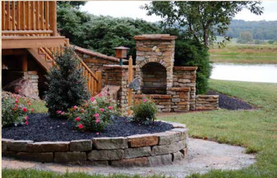
Southern Buff 4\"/>