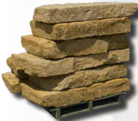
Rustic Buff Natural Steps 3' -4' # 32102