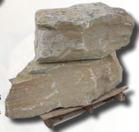
16" Chunks 25" Chunks # 63131 # 63133