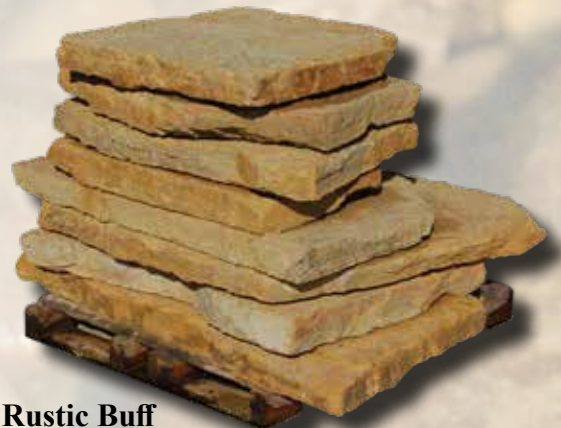
Rustic Buff Jumbo Flagging Single Stack # 32114