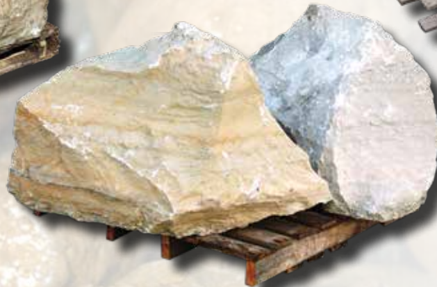
Canyon Tan Accent Boulders # 66101