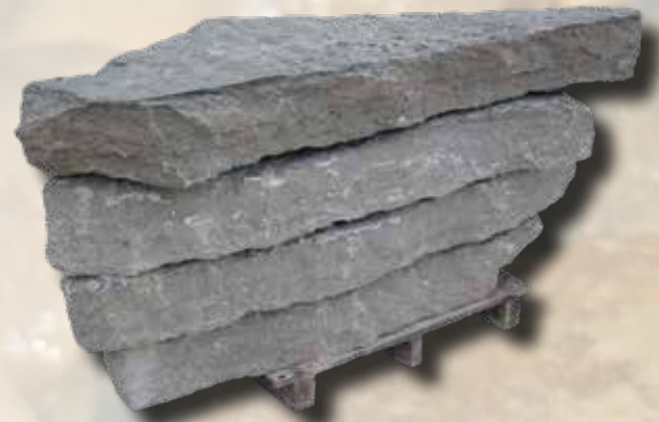
Canyon Gray 6" - 8.5" Slabs # 53106