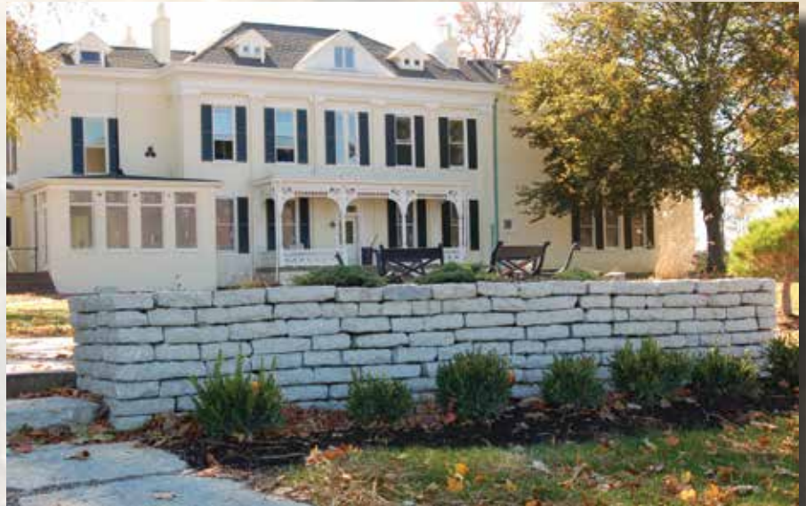
Canyon Gray Wall Stone