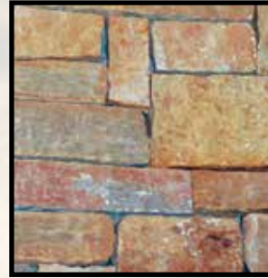
Rustic Buff # 31240