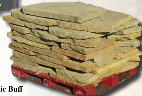
Rustic Buff Reg. Large Flagging # 32113