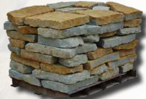
Rustic Buff Web Wall # 31110