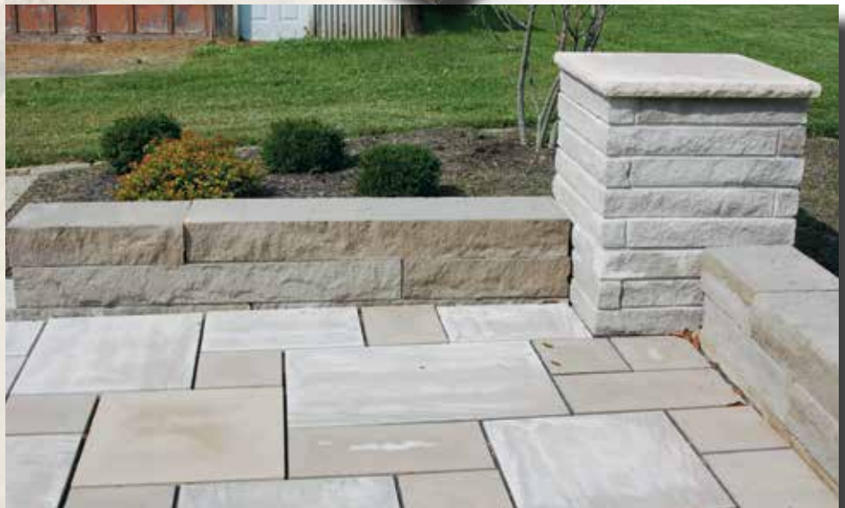
Indiana Limestone Pier Caps, Cut Wall, & Patterned Flagging