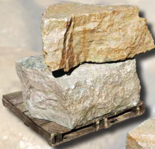
Southern Buff 16" or 25" Chunks # 43172 for 16" # 43173 for 25"