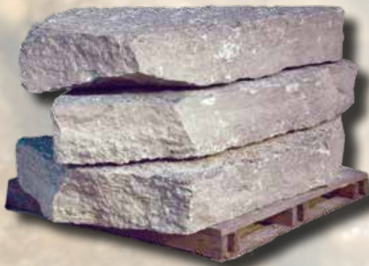
Canyon Gray 10.5" - 12" Slabs # 53110