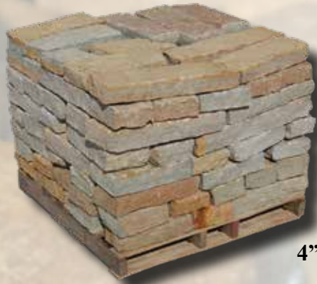
Southern Buff 4\"/>