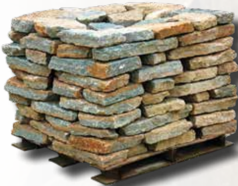
Southern Buff Select 3” Wall Stone Natural Wall Stone # 41103