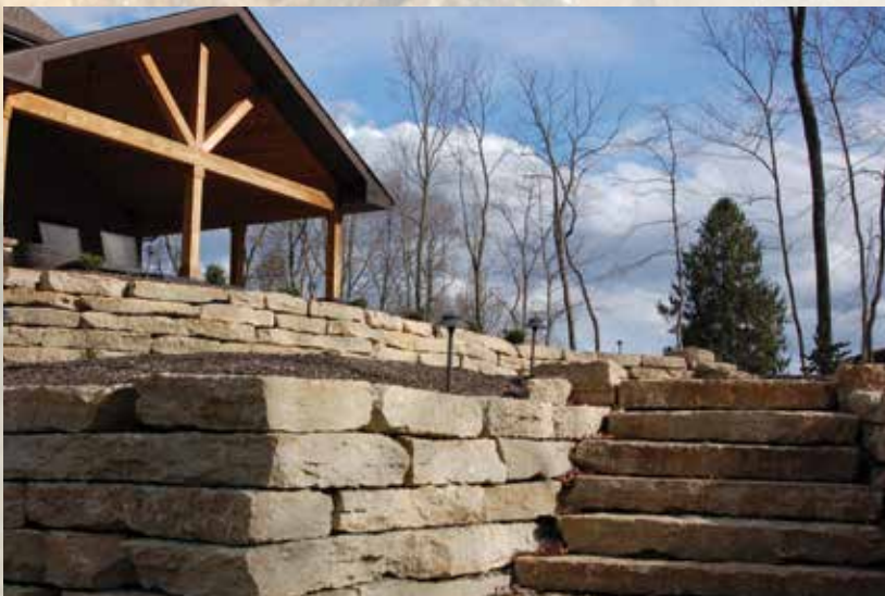
Rustic Buff Beige Outcroppings & Jumbo Natural Steps