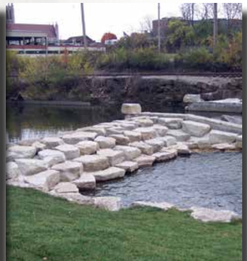
Canyon Tan 25" Chunks