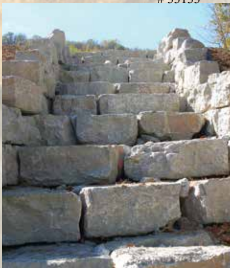
Southern Buff Beige Chunks