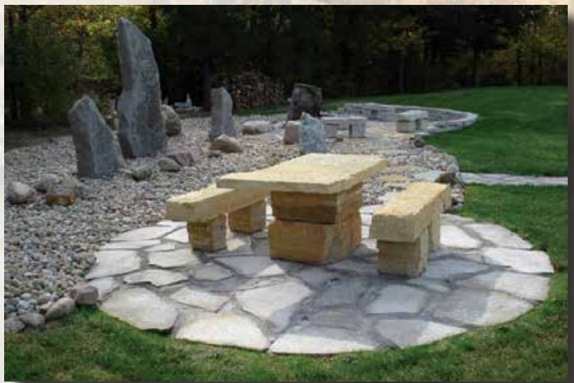
Canyon Gray Flagging