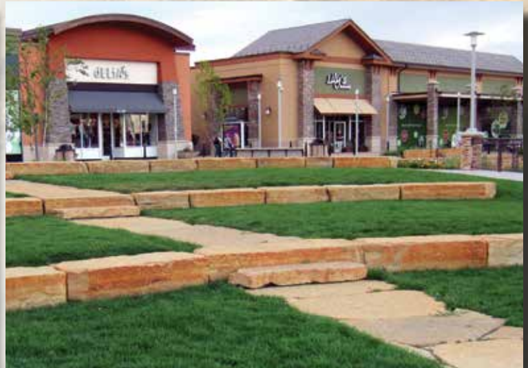
Rustic Buff Benches